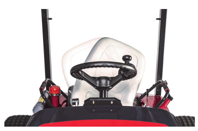
30 degree tilting seat fitted as standard