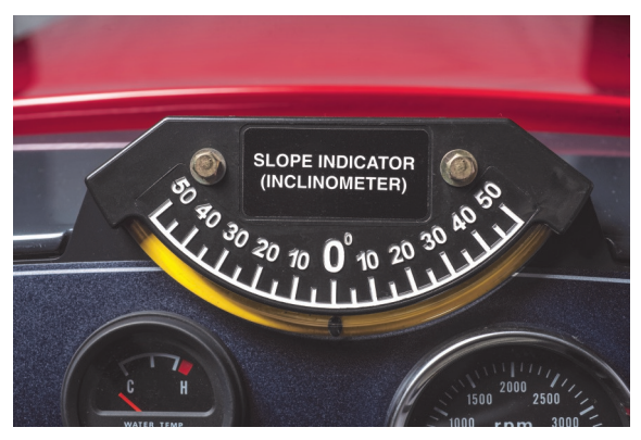
Integral tilt meter fitted as standard