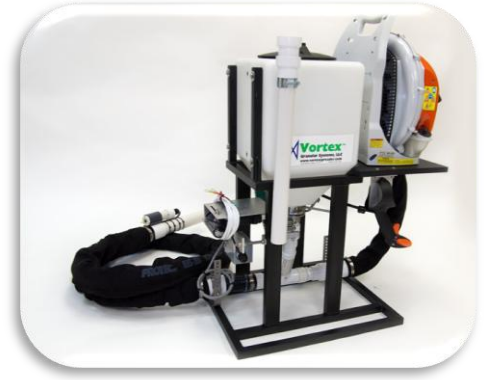
Compact Skid Mounted Unit