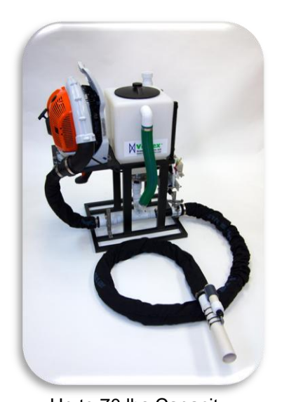
Up to 70 lbs Capacity