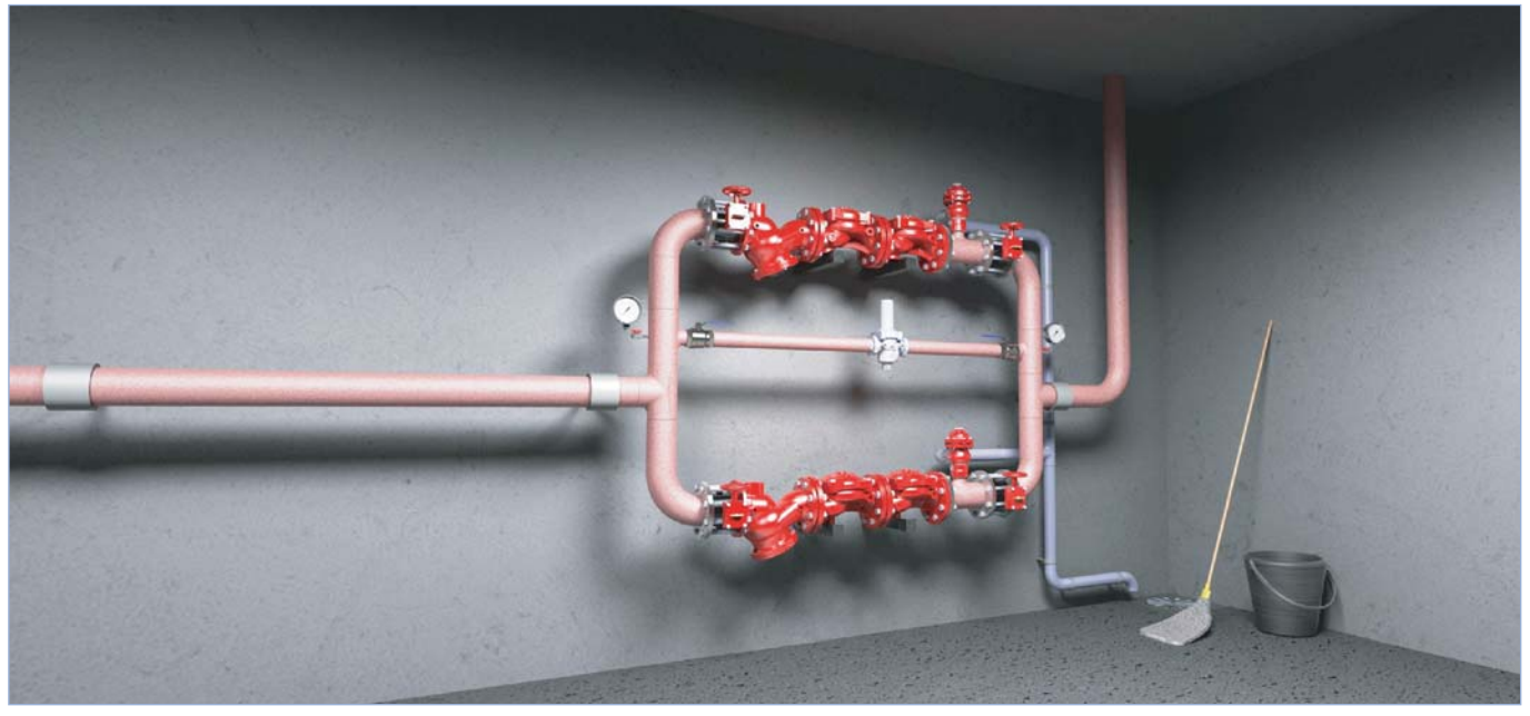
For illustration only