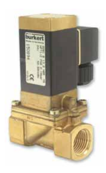
Model 0281B Normally open