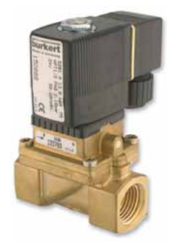
Model 5281A Normally Closed